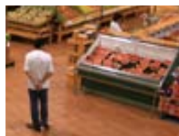
2nd Streaming Cropped area (up to VGA resolution)