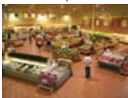
1st Streaming SVGA video of a whole