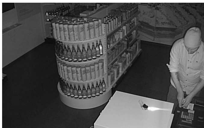
As light diminishes below a certain level, the cameras can automatically switch to night mode to deliver quality images in dark environments.

AXIS M11-L Series provides day and night varifocal multi-in lens and adjustable IR LED illumination for optimal light in selected viewing angles. With Axis OptimizedIR, a power-efficient LED technology that provides an adaptable angle of IR illumination and discreet integration of IR LEDs, the cameras provide automatic illumination of a scene in complete darkness, at an event or when requested by a user. The IR LED illumination which is invisible to the human eye, is perfect for discovering objects in a range of up to 15 meters (50 ft)