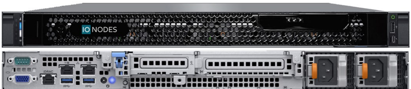
Single processor version

The CR6 series of video servers is designed, tested and certified to run the latest industry-leading video management software solutions. With capacities ranging from terabytes to petabytes, and high performance video throughputs, rest assured that the CR6 line of servers will meet the most demanding requirements.